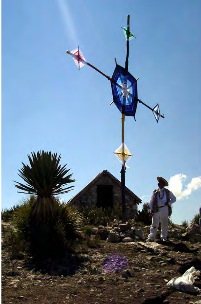
“Tsikuli”, built with the spirit of oneness for peace at the spiritual culmination of the Sacred Route protected by Conservación Humana. El Quemado, San Luis Potosí, Mexico. June 11, 2006.

The project OraWorldMandala originated from an artistic research work based on the concept of the Mandala: Ora , from Latin “prayer”, World , our planet and its human continent and Mandala , from Sanskrit.