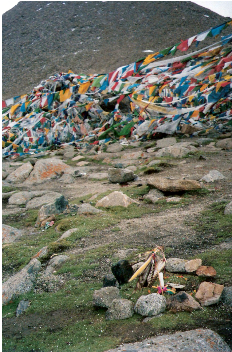
In the foreground the exoteric Tibet-Mexico bridge building offering; in the background, Drolma Pass, Kailash. Tibet. June 25 2001.

In the year 2001 with a group of Buddhist from Casa Tibet Mexico a pilgrimage was made to Kailash, which is Asia's most sacred mountain. It stands in a remote corner of the region of Ngari in Western Tibet, isolated by rugged terrain. Its name is Mount Kailash: Nature's Grand Mandala.