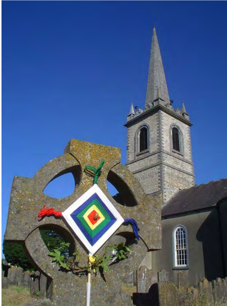
Offering in Longford. Ireland. One of 52 offerings and minutes of silence made as part of a heart shaped pilgrimage to honor Saint Patrick's Battalion that in 1847, defended Mexico from foreign invasions. July 17, 2006.

The Concordia project consisted in conducting a heart shape pilgrimage in Northern Ireland and in The Republic of Ireland, to stress: the gratitude of Mexico to the Irish Saint Patrick's battalion; the deep roots of Druid and Huichol shaman magic-religious traditions; and the legitimate aspirations of our people for justice, dignity and peace. In 52 holy locations " Tsikulis " were offered to honor the heroes.